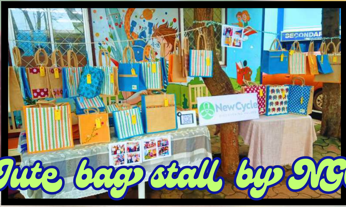
Tote bag stall by NGO